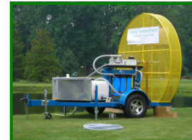
Pictured with optional Aquathin filtration systems